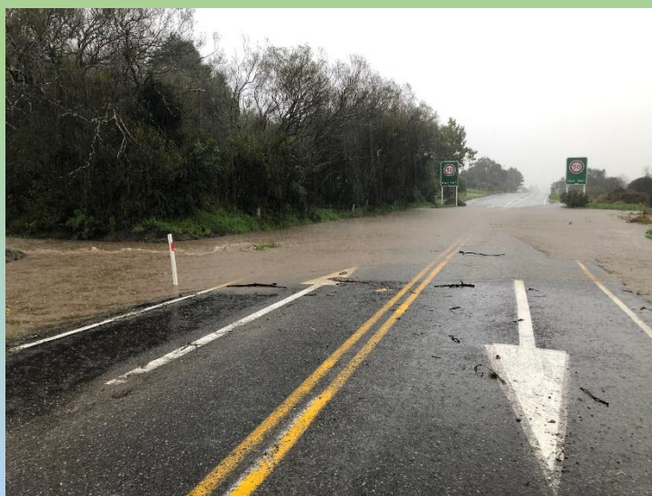
Hari Hari Highway – Surface Flooding