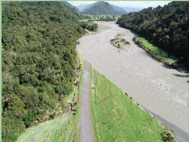
Upper Kokatahi Road – River Washout