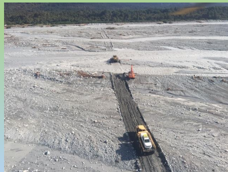
Fording the Waiho River after bridge washed away