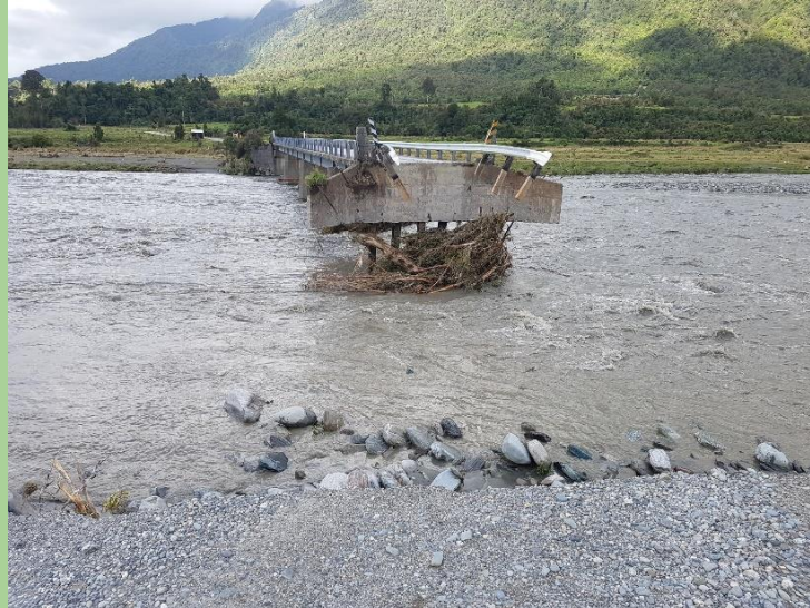
Lansburgh Bridge - Washout