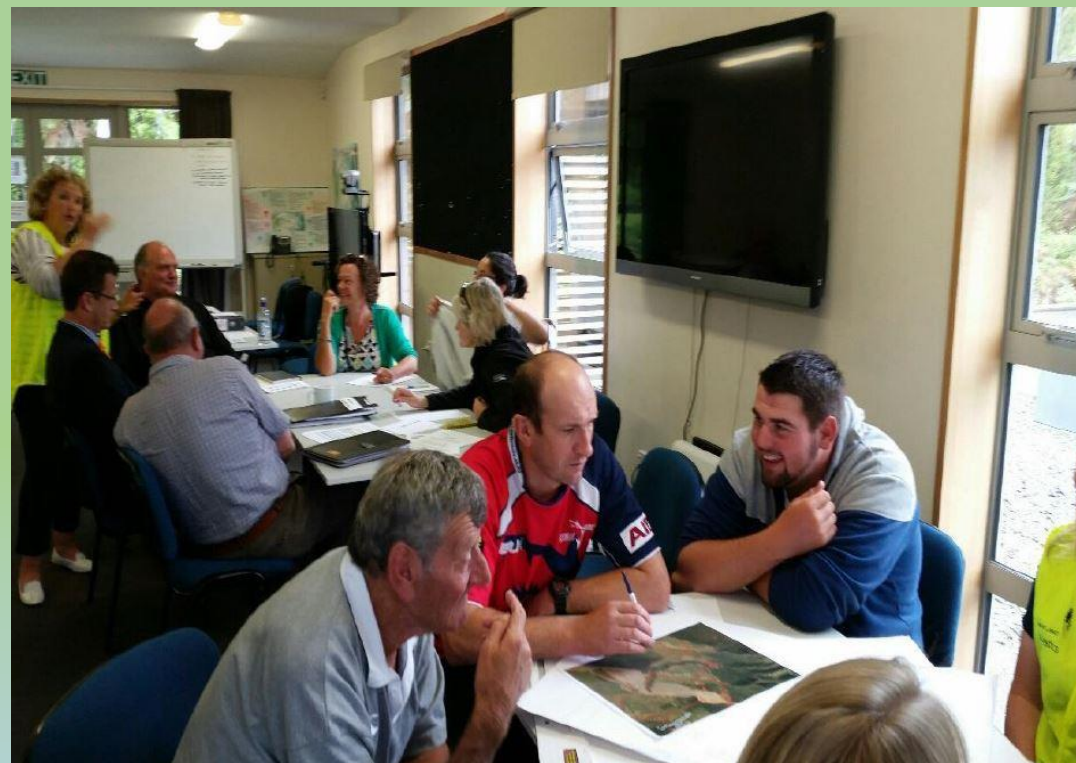
Civil Defence Training Session – Franz Josef