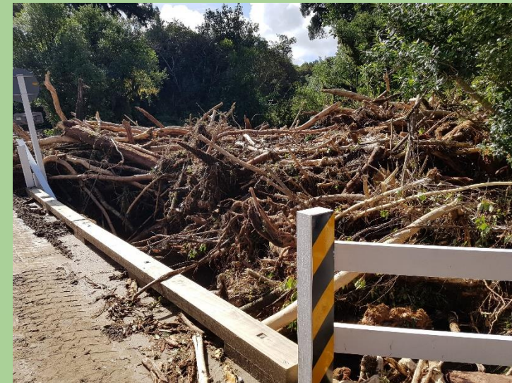
Rose Creek – Debris buildup